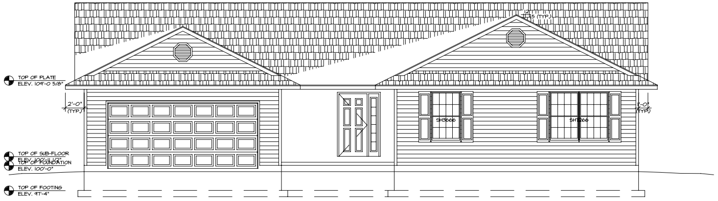
FRONT ELEVATION A-1 SCALE: 1/4"=1'-0"